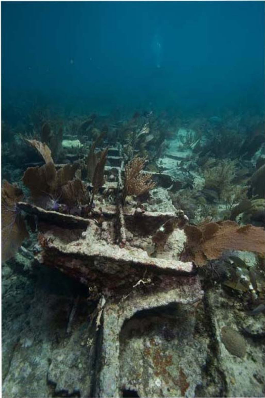
Figure 2. The wreck's keel and keelson along its longitudinal axis.