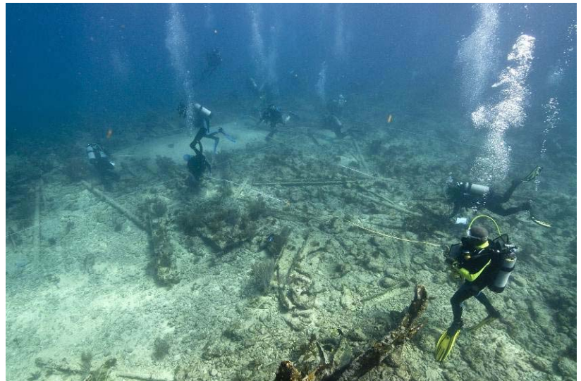
DWP Participants Mapping the Wreck Site