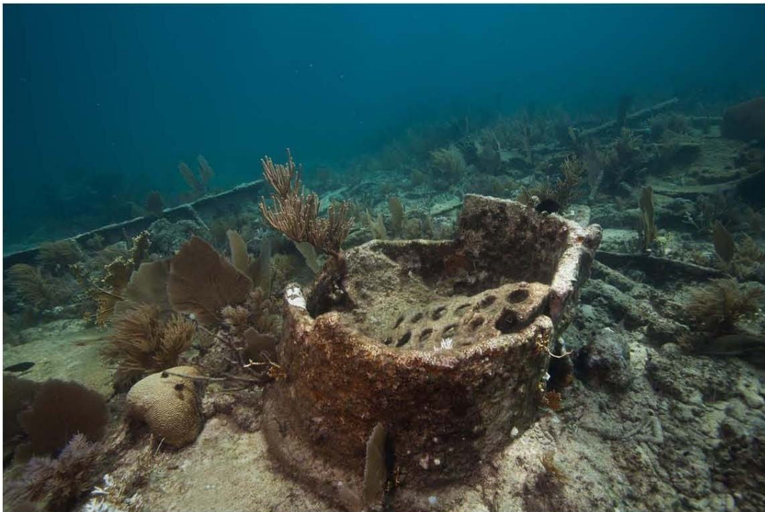
Figure 4. Remains of a boiler.