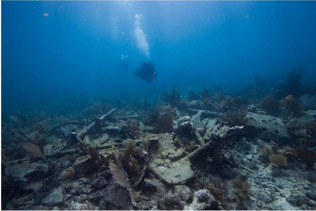
Figure 3. Divers swim over the wreck's fractured hull.