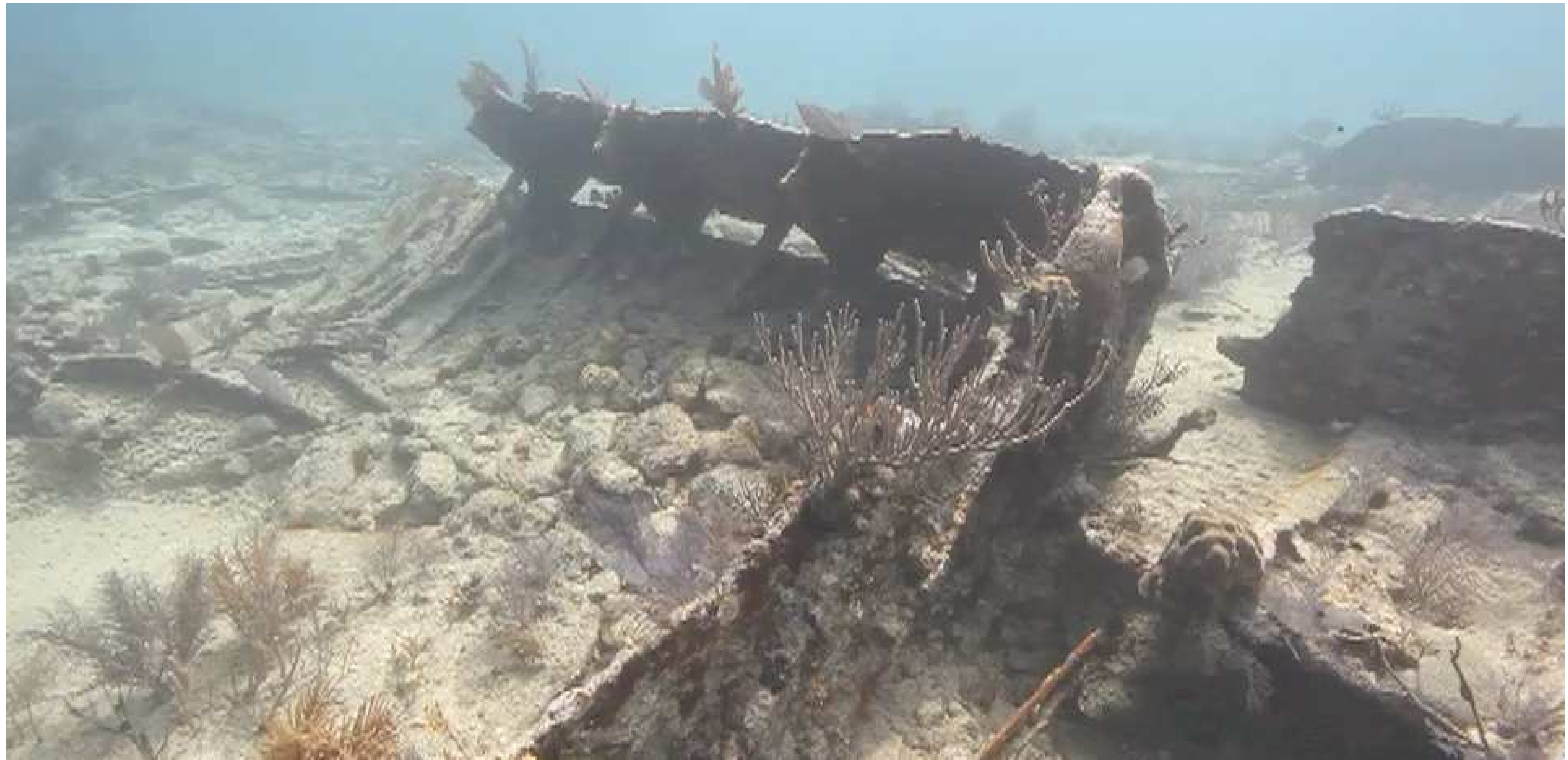
UNDERWATER PHOTOGRAPH OF SHIP