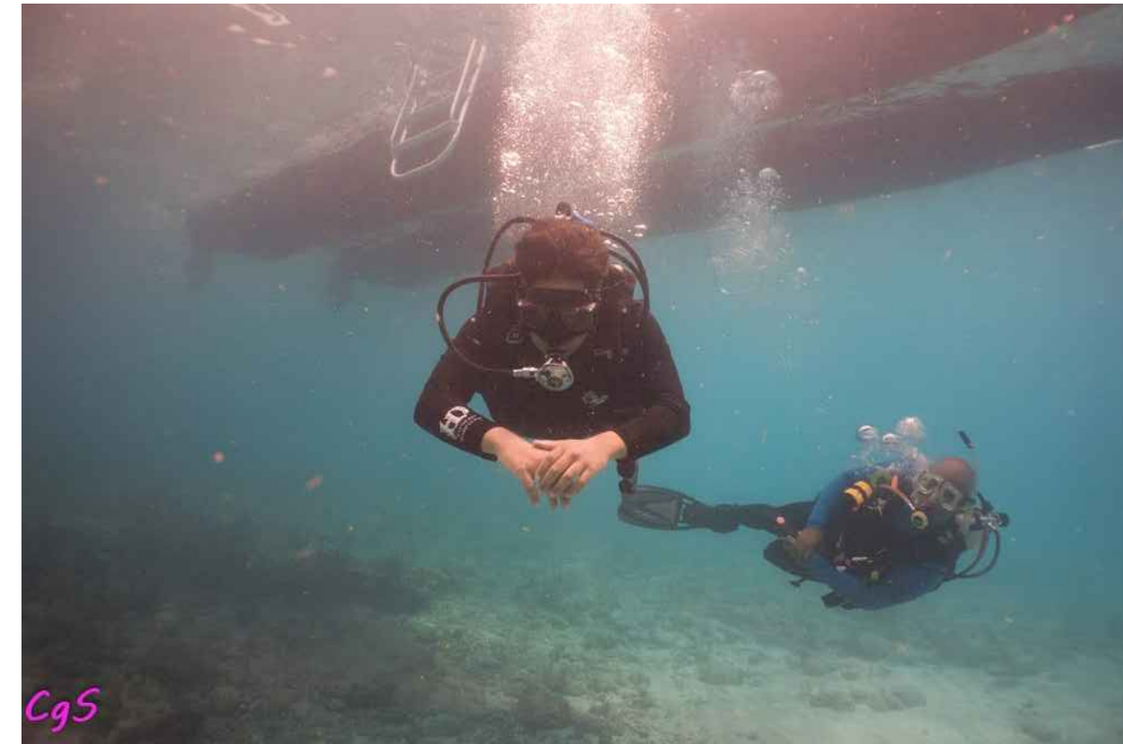
Descending to Site