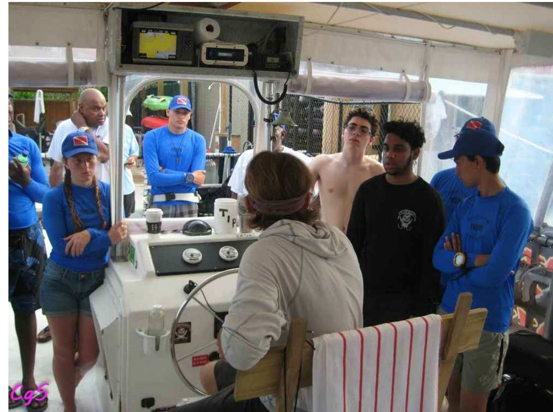
Morning Briefing on Boat