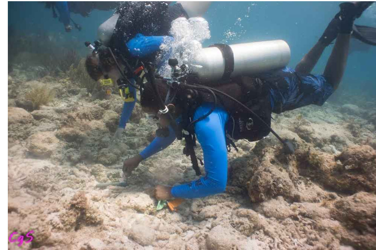
Assigning Pin Flags to Artifacts