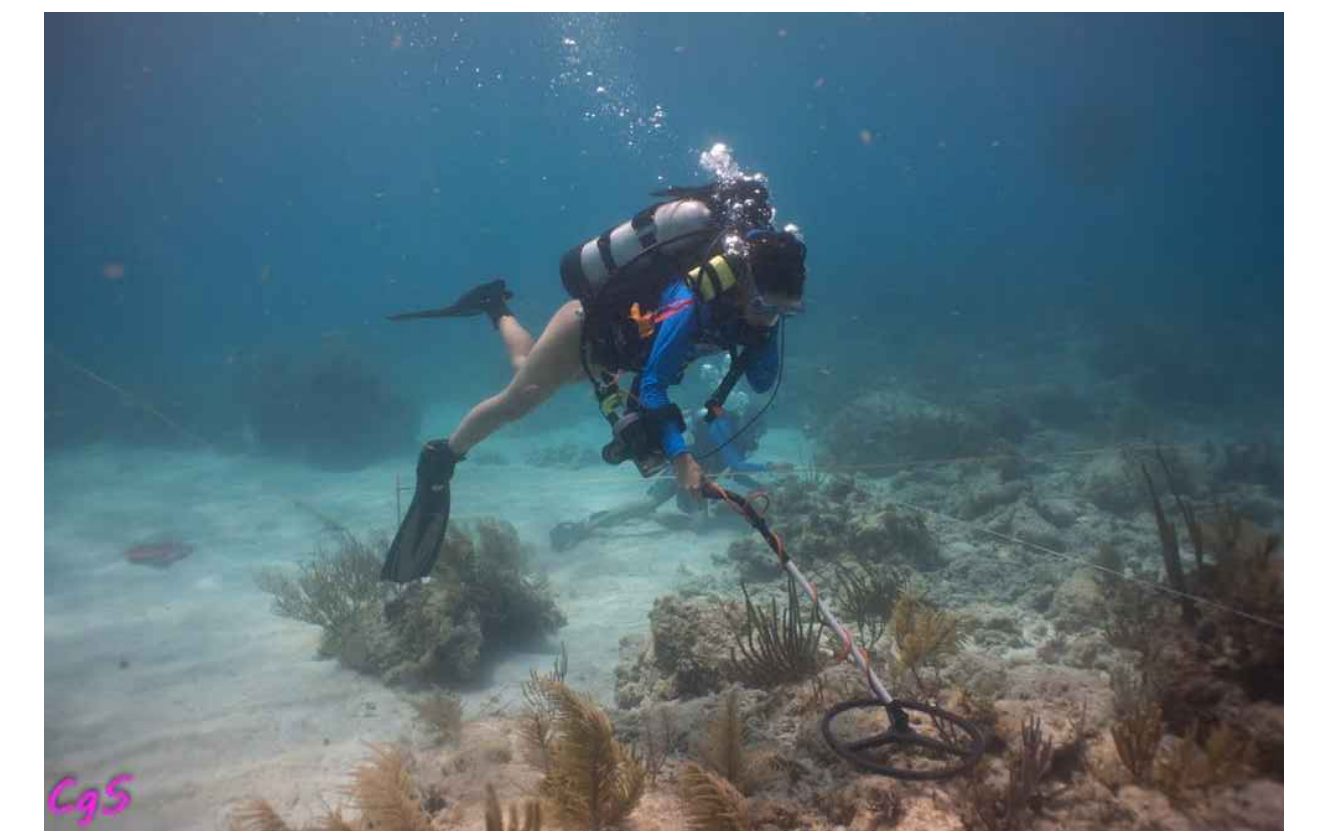
Metal Detector Sweep