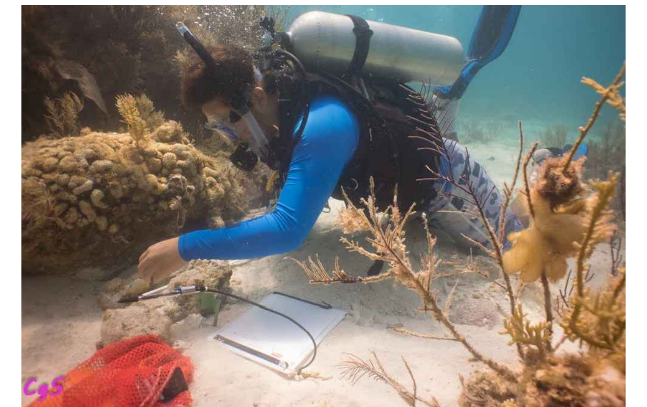
Diver Measuring Artifact