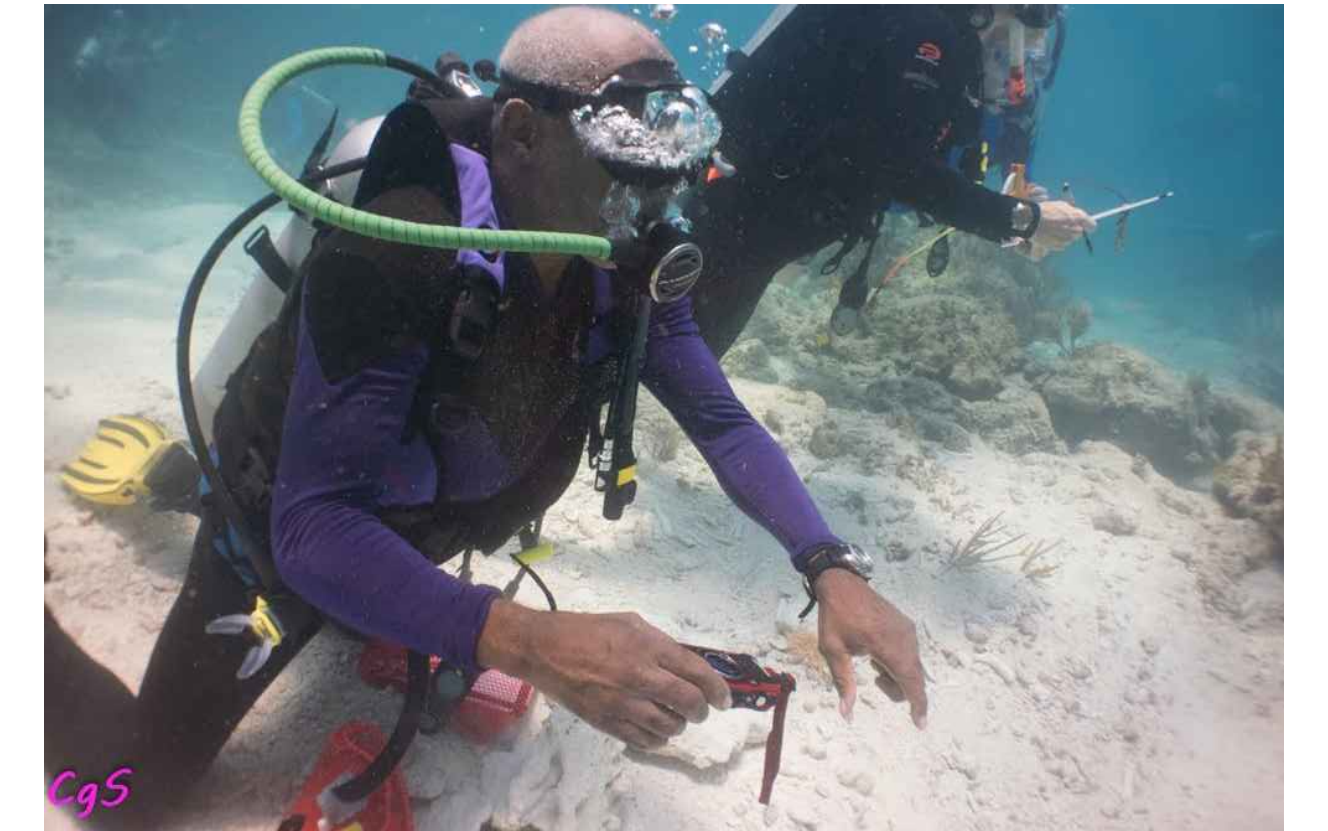
The Boss Checking His Crew