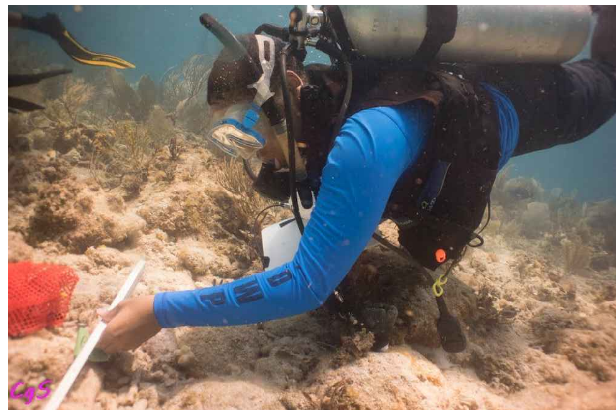
Diver Measuring Artifact