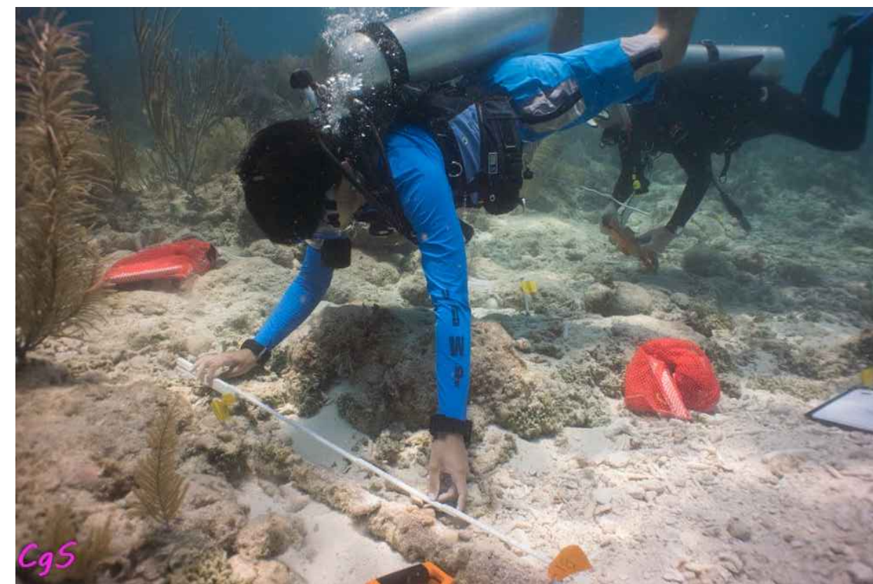
Diver Measuring Artifact